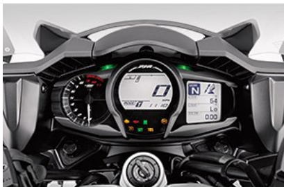
The three-part instrument panel (multi-dot LCD) emulates the styling of a luxury sports car.